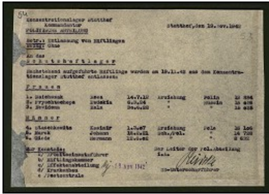
Fig. 3. A sample scanned document.

content XML as a map, the OCR process can be directed to that specific location in the image and fill-in the recognised text into the content XML structure.