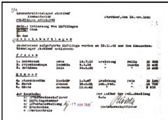
Fig. 5. The document in Fig. 3 with all non-foreground elements removed (white).

background (similarly, there are relatively dark artefacts that subsequent processes have to analyse and identify by more refined processing). The result of the background removal process can be seen in Fig. 5.