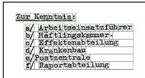
Fig. 6. Example of individual characters located and enhanced within text regions.

Having identified the position of all characters in the image, localised processing can take place for each character. This processing, aims at enhancing the characters and producing a bi-level image of each character, which will be used by OCR in the next stage.